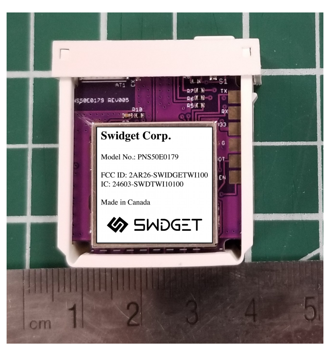
Figure 2: Bottom View