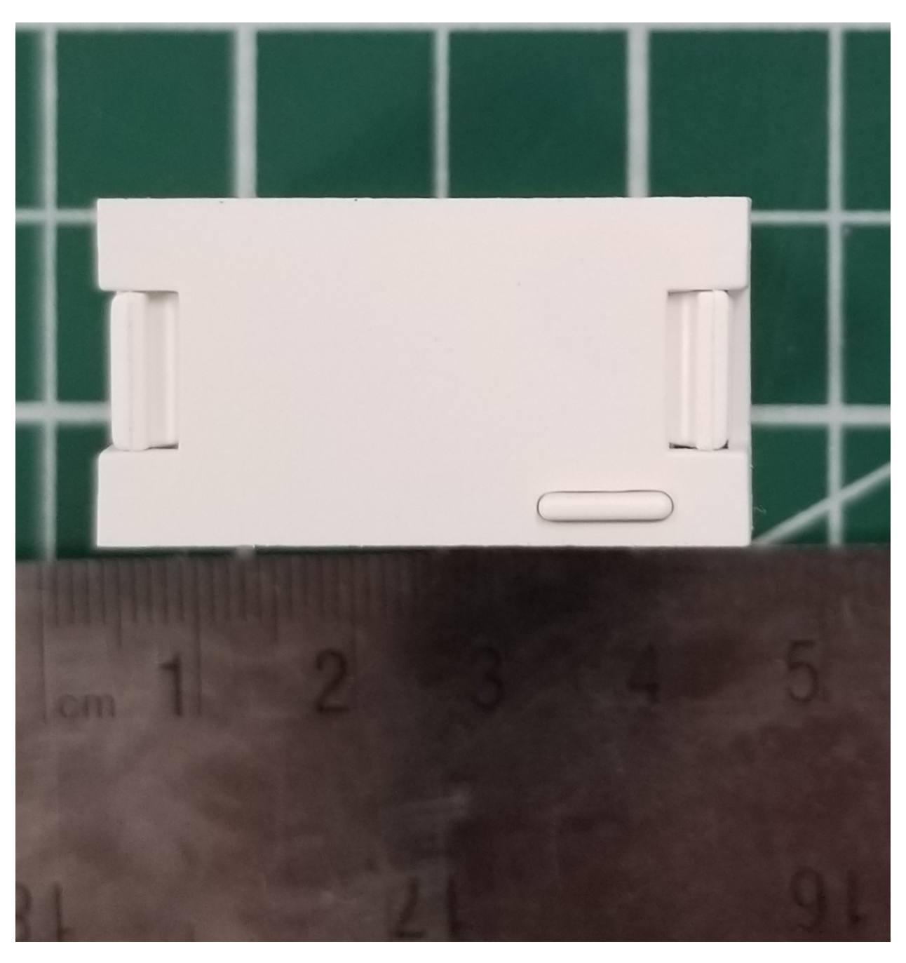
Figure 3: Front View