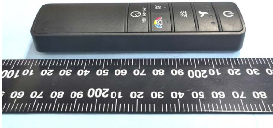
EUT View 6