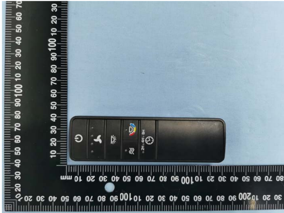
EUT View 2