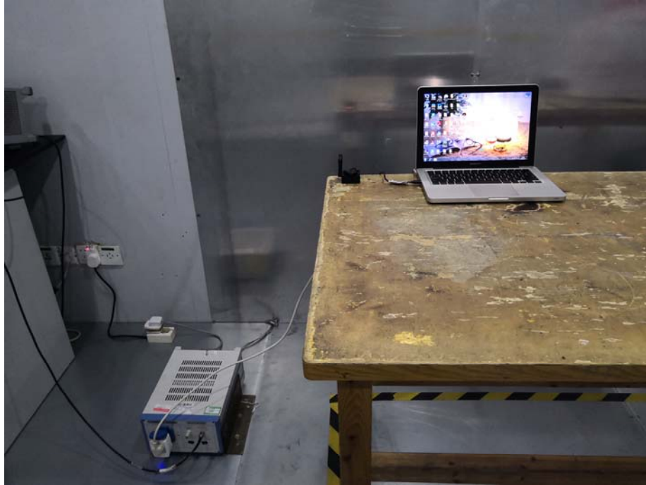
Test Site 1#