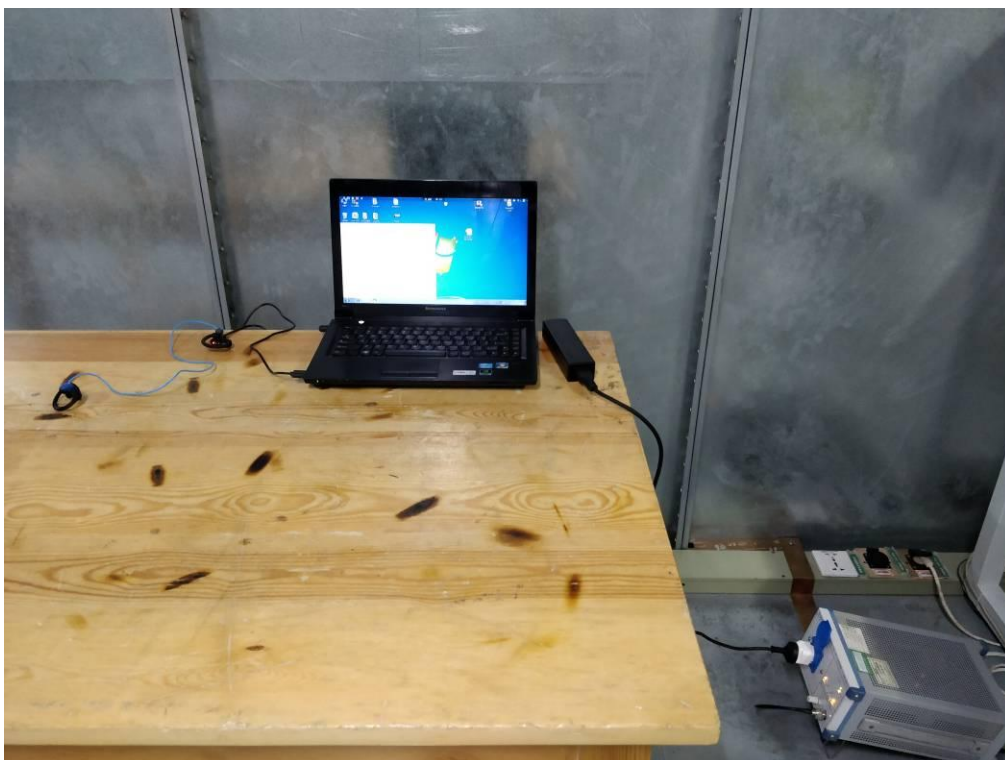
AC Conducted Emission of charge from PC mode