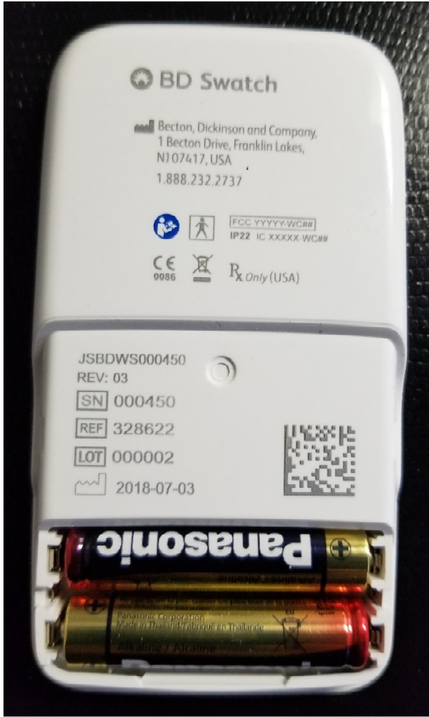
Figure 4: 328622-Wireless controller Rear view with battery compartment Open