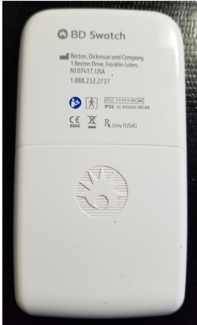
Figure 3: 328622-Wireless controller (Rear view)