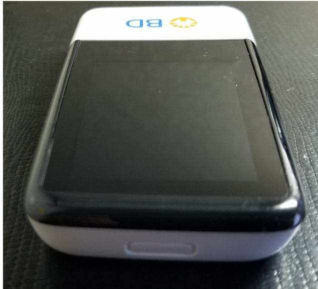
Figure 5: 328622-WC Top view with ON/OFF button visible