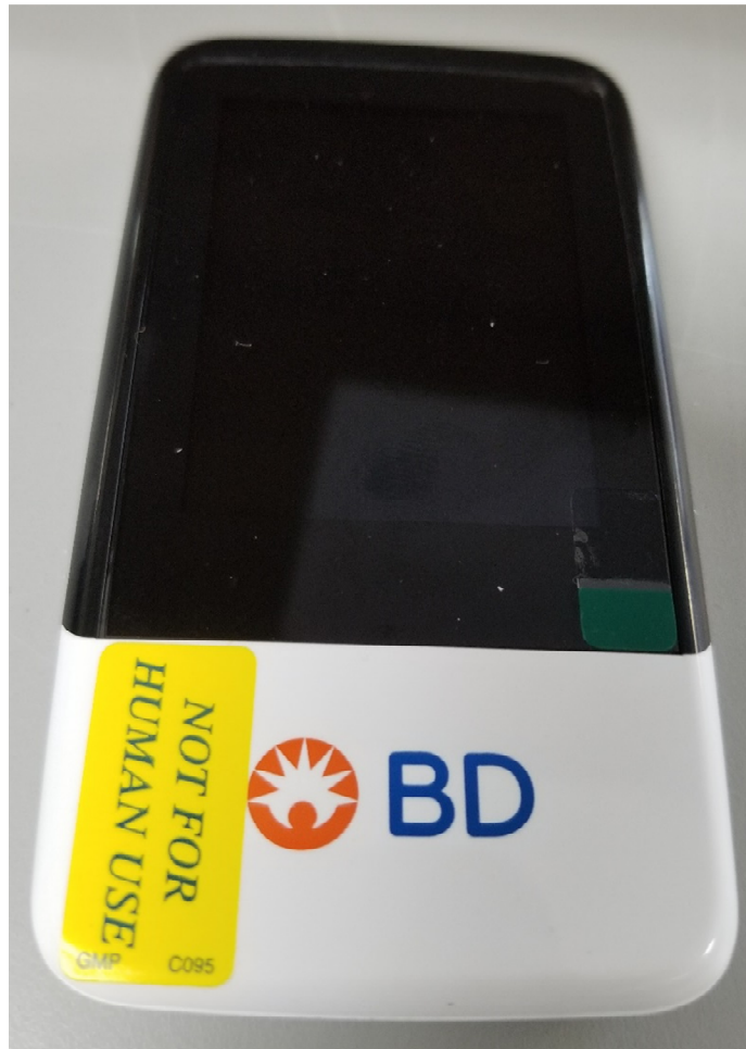
Figure 1: 328622- Wireless Controller Front side (oblique view)

Becton Dickinson and Company 200 Bulfinch Drive Suite 100 Andover, MA 01810, USA