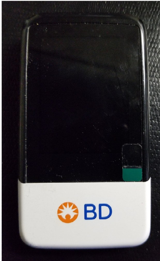
Figure 2: 328622-Wireless controller Front (Top view)