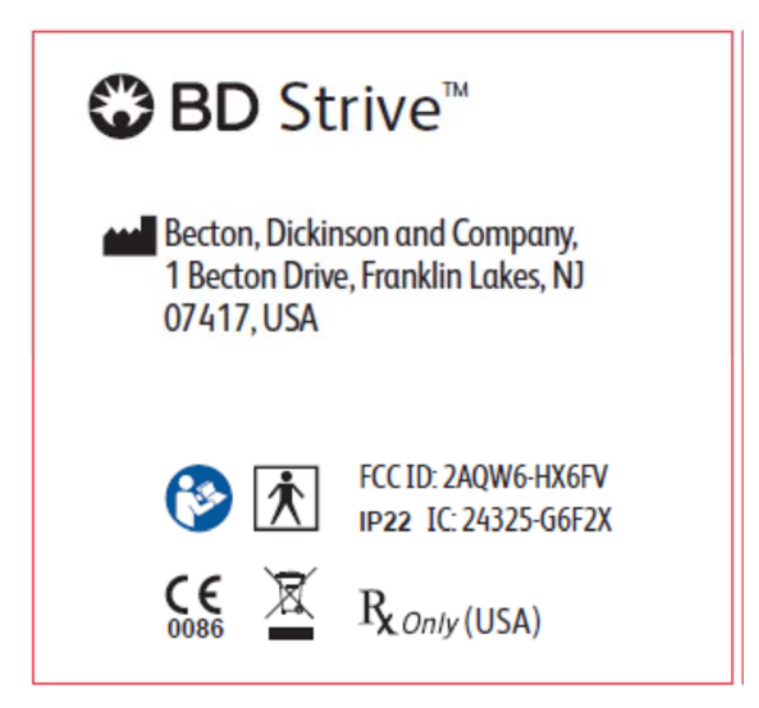
Fig 2: Wireless Controller Rear Housing Upper marking