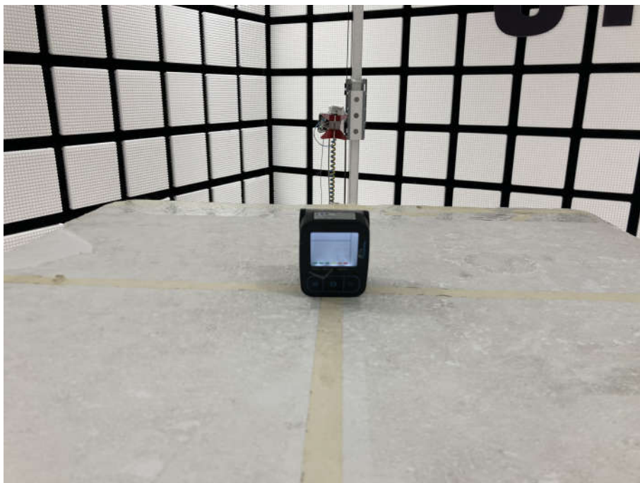
Radiated spurious emission Test Setup-2(Above 1GHz)