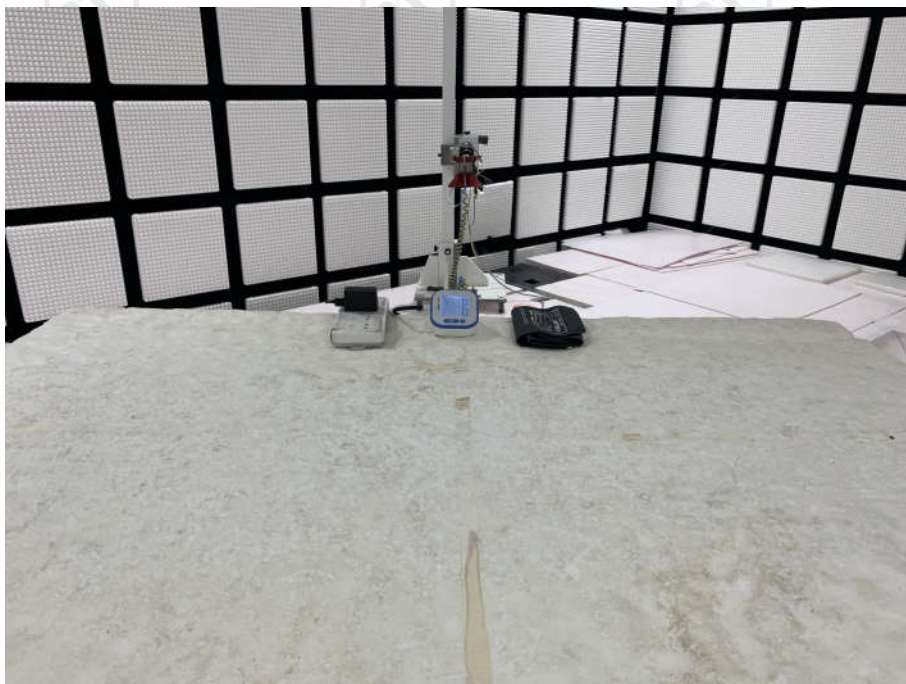
Radiated spurious emission Test Setup-2(Above 1GHz)