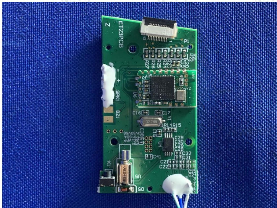
View of Product-20