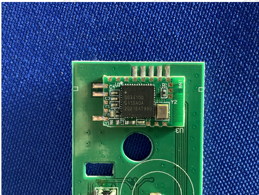
View of Product-16