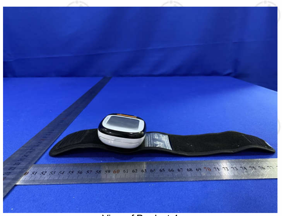
View of Product-4