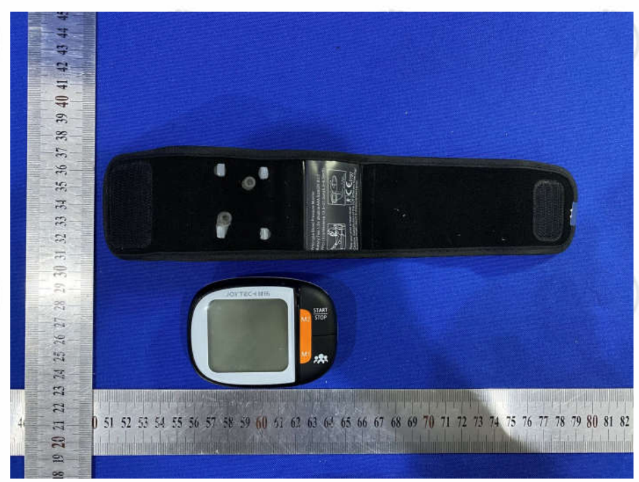
View of Product-7