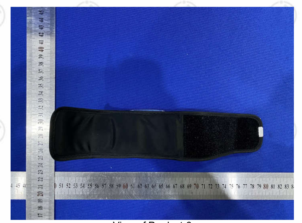
View of Product-6