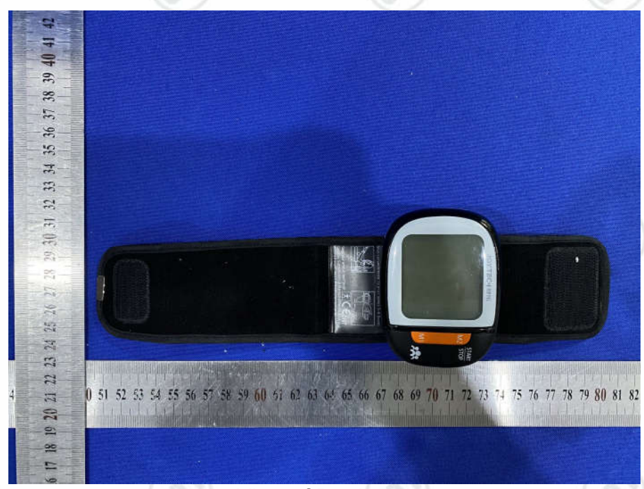
View of Product-1