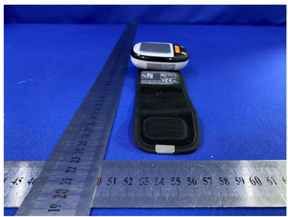
View of Product-5