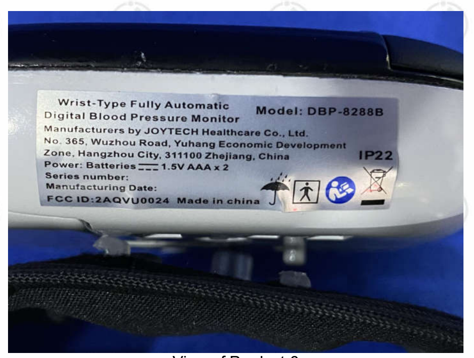
View of Product-8