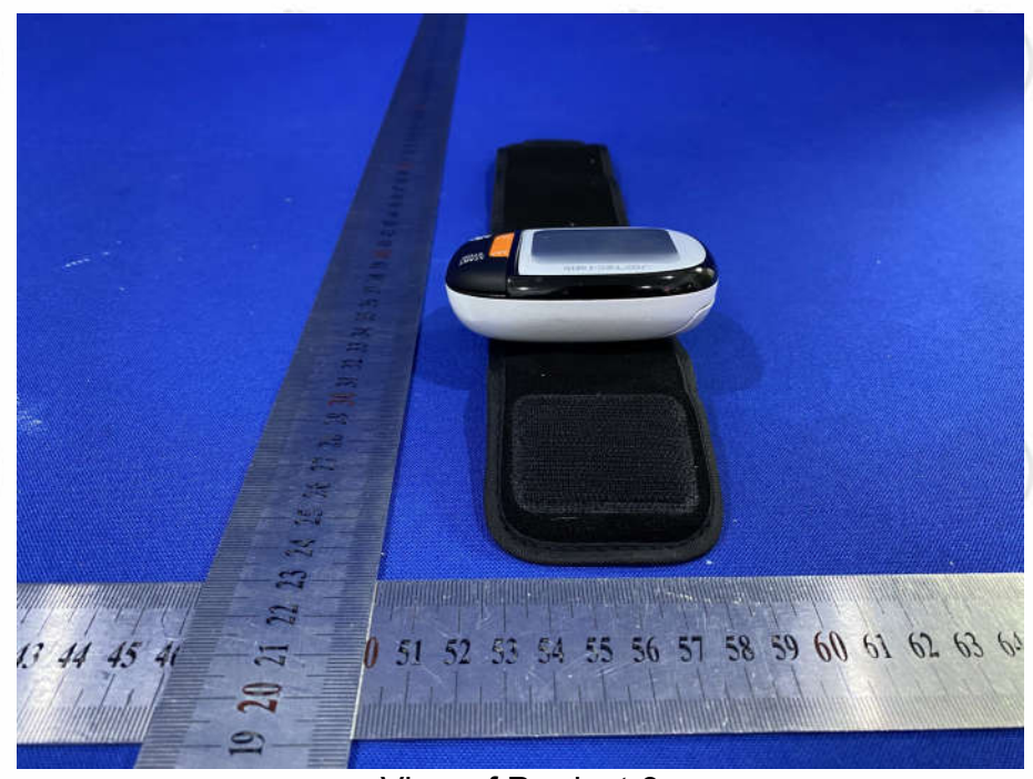
View of Product-3