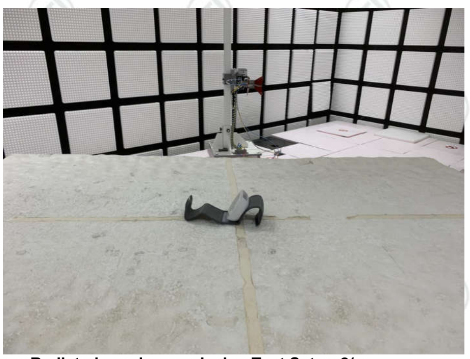
Radiated spurious emission Test Setup-2(Above 1GHz)

Hotline: 400-6788-333 www.cti-cert.com E-mail: info@cti-cert.com Complaint call: 0755-33681700 Complaint E-mail: complaint@cti-cert.com