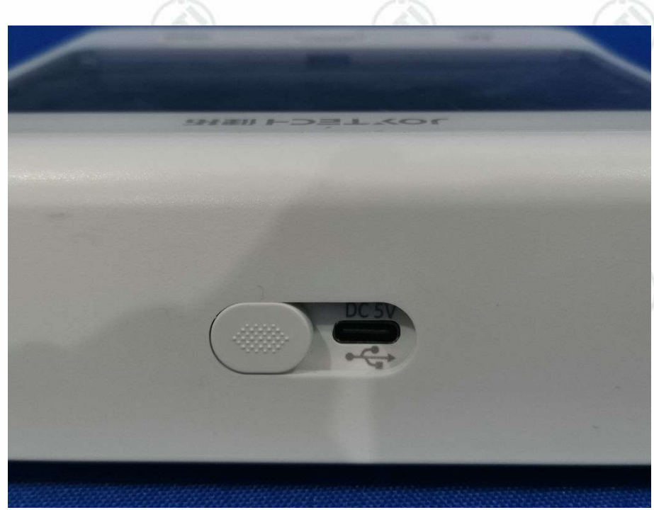
View of Product-9