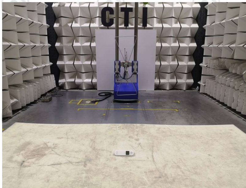
Radiated spurious emission Test Setup-2(Below 1GHz)