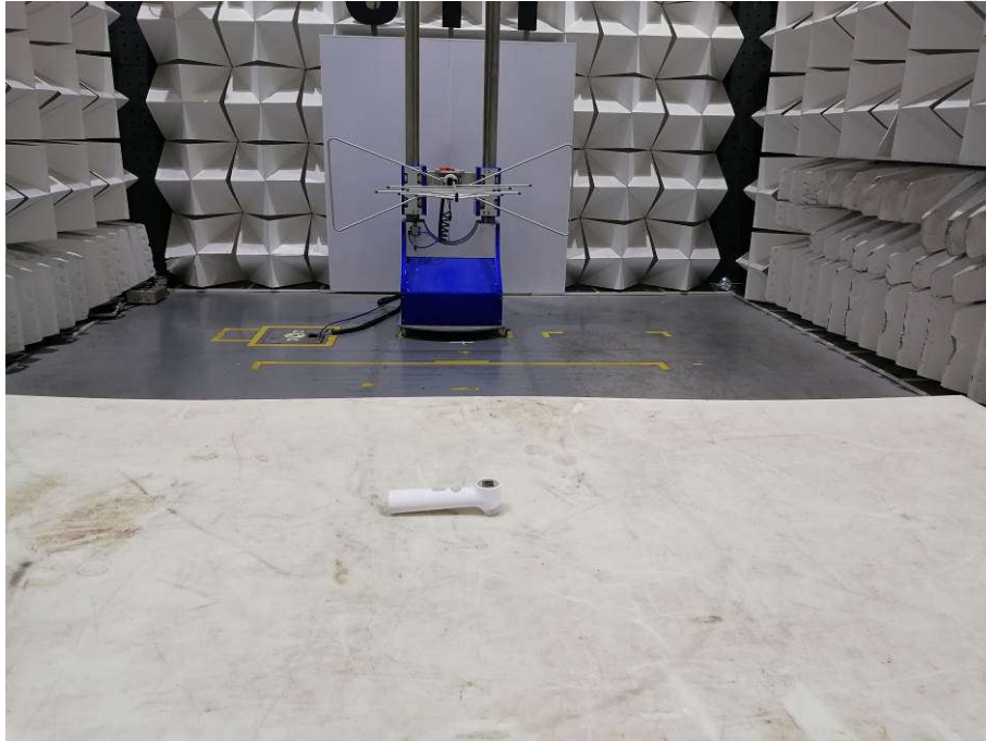
Radiated spurious emission Test Setup-1(Below 1GHz)