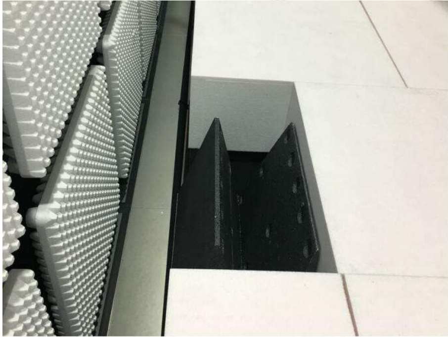
Radiated spurious emission Test Setup-3(Above 1GHz) There are absorbing materials under the ground.