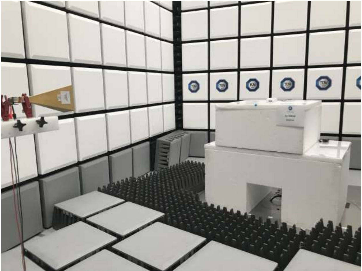
Radiated Emissions Test Setup (above 1GHz)