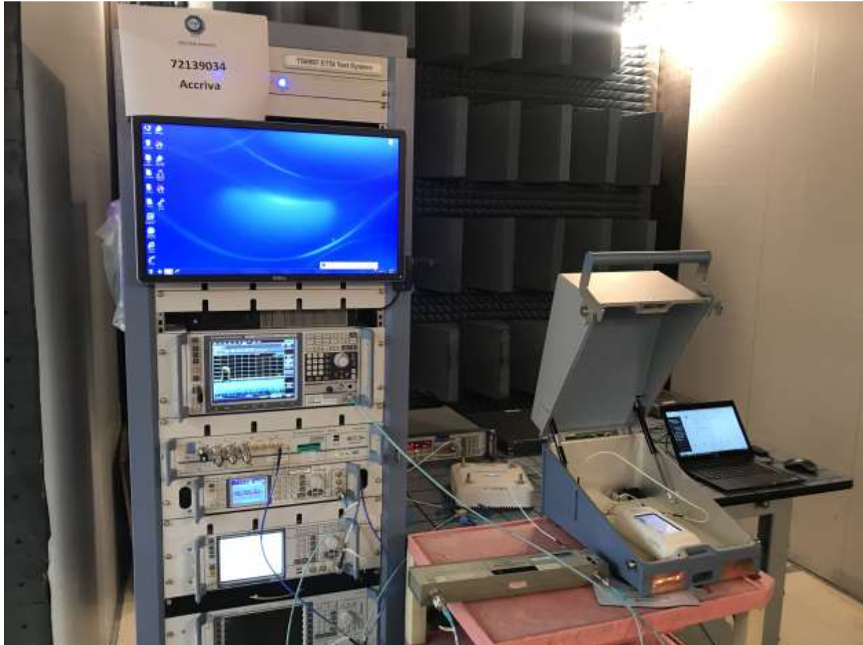
Antenna Conducted Port Test Setup