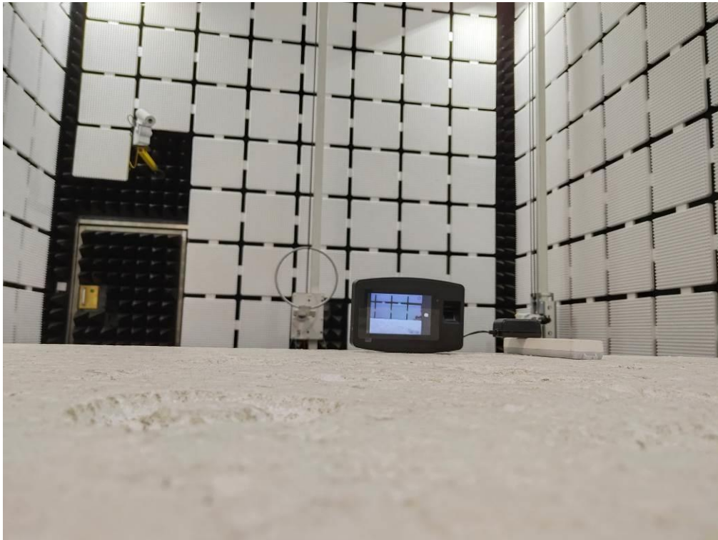
Below 30 MHz