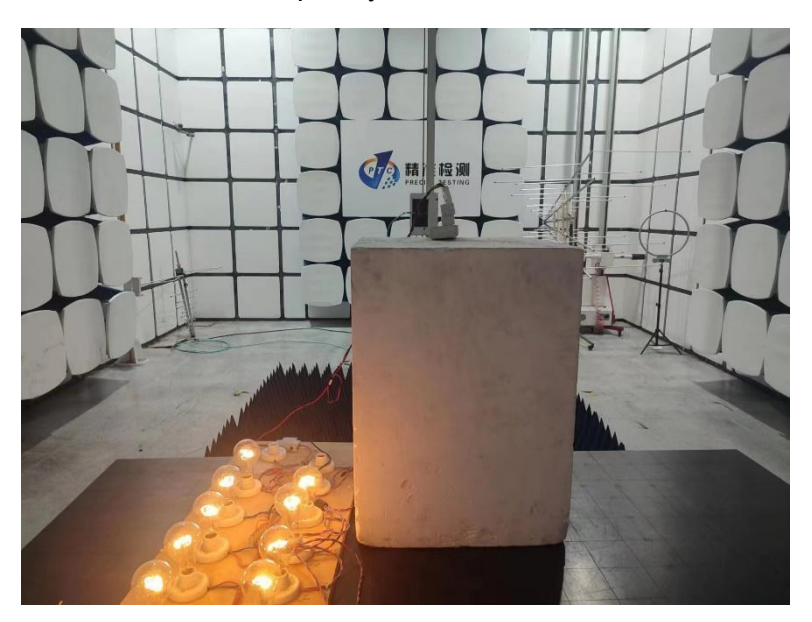
Test frequency from Above 1GHz