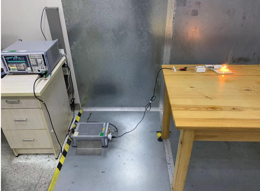
Radiated Spurious Emissions From 30MHz-1000MHz