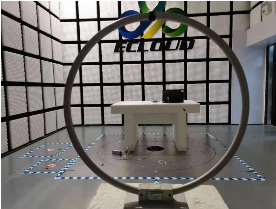
Fig. 1 Radiated emission setup photo(Below 30MHz)