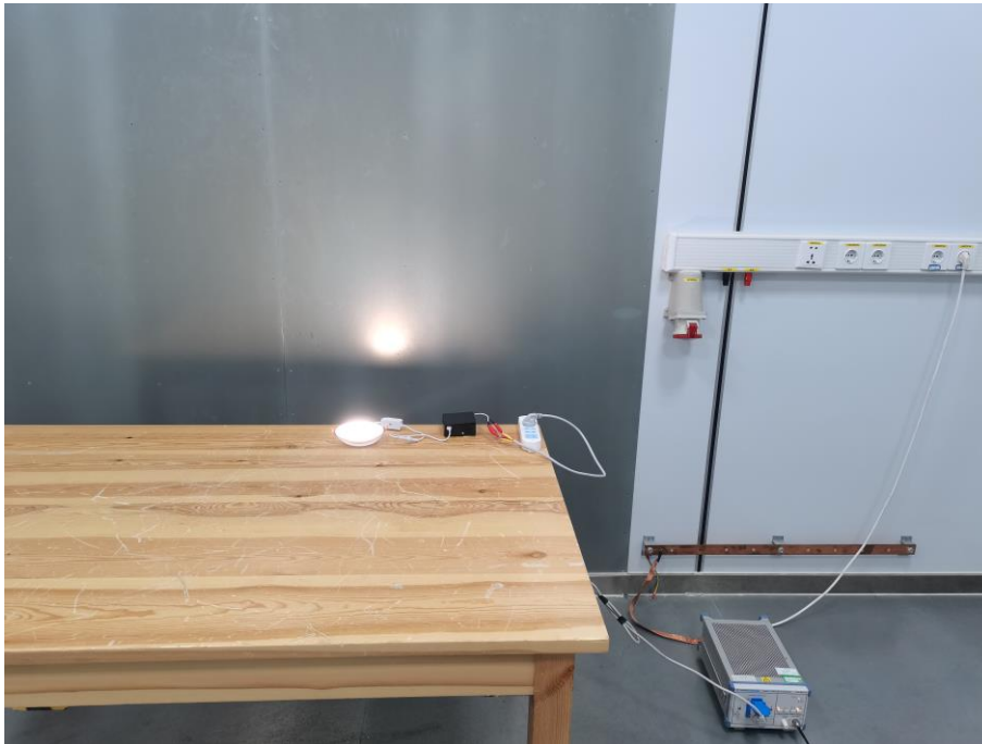
Fig. 4 Power line conducted emission setup photo