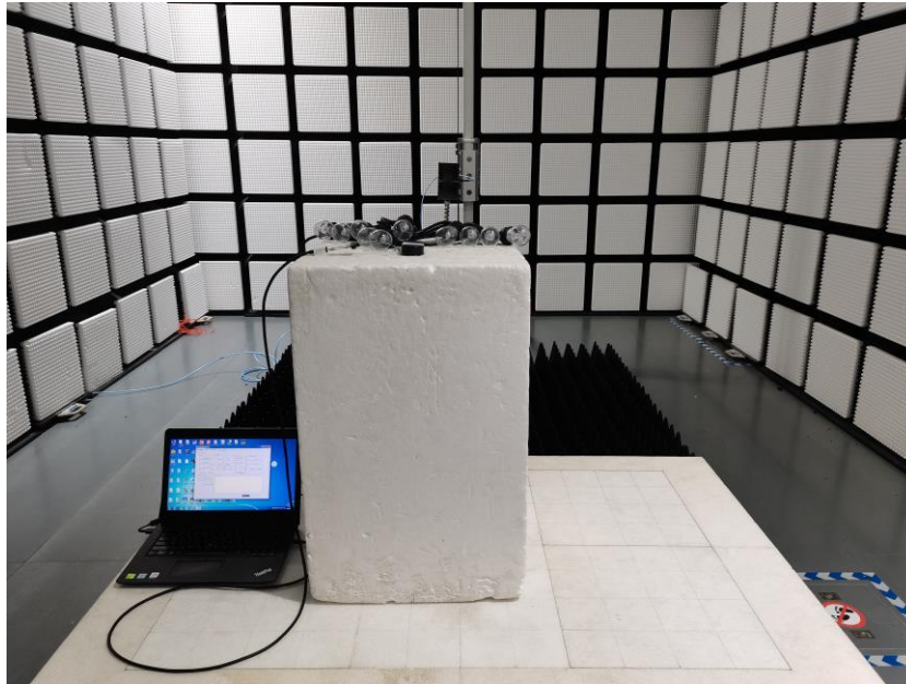
Fig. 3 Radiated emission setup photo(Above 1GHz)