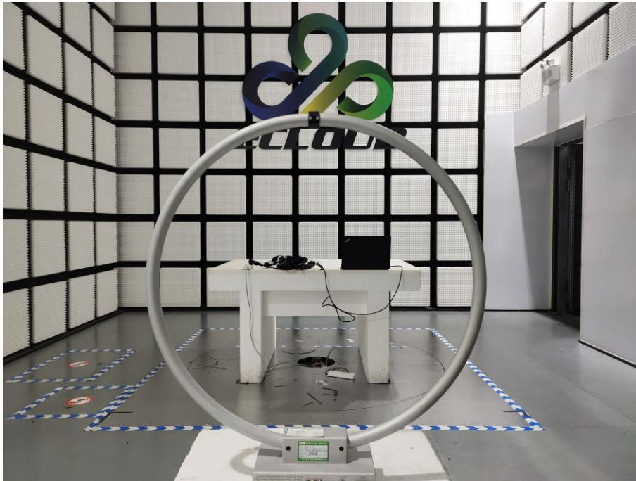
Fig. 1 Radiated emission setup photo(Below 30MHz)