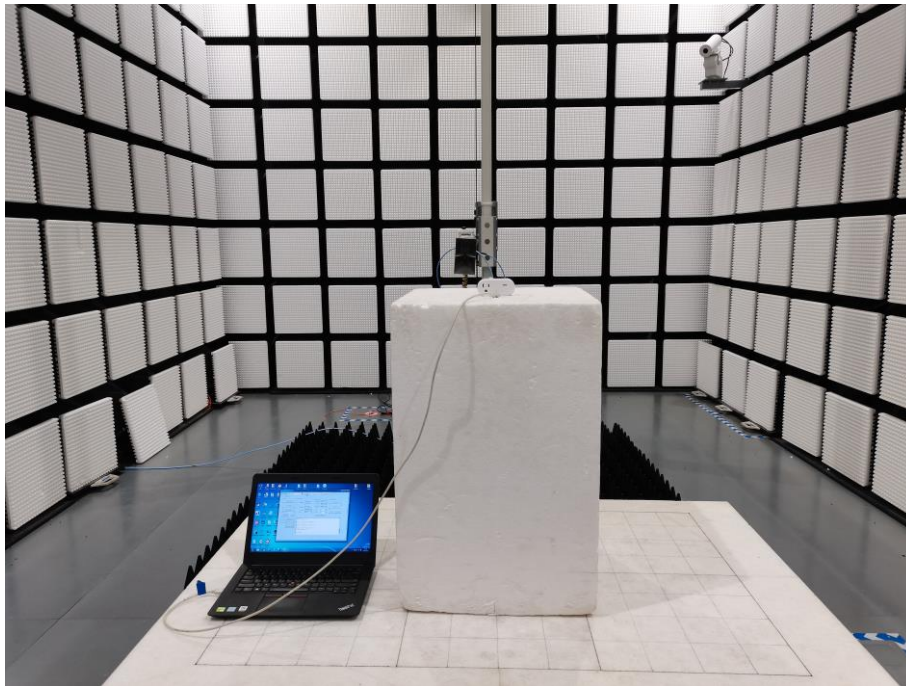
Fig. 3 Radiated emission setup photo(Above 1GHz)