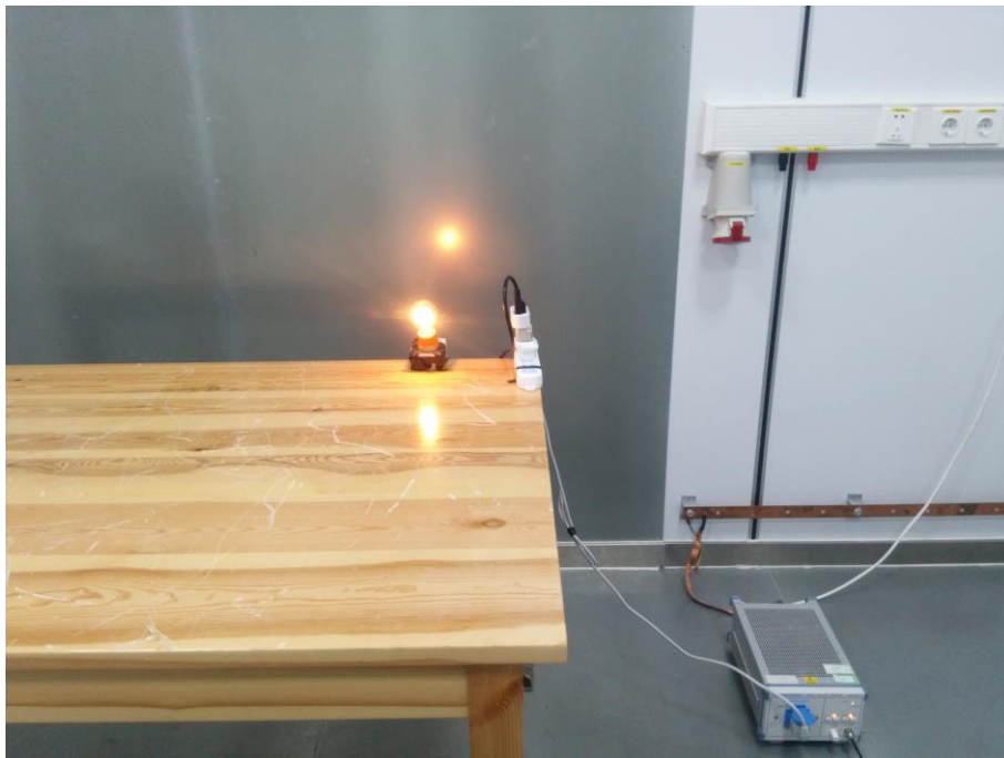
Fig. 4 Power line conducted emission setup photo