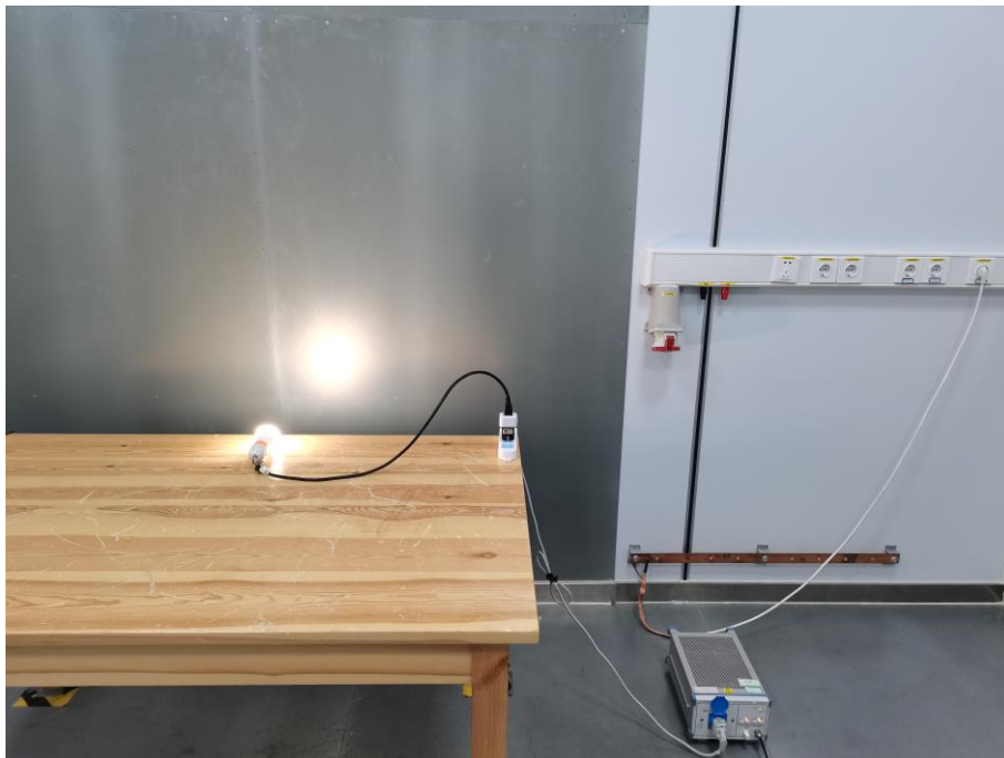
Fig. 4 Power line conducted emission setup photo