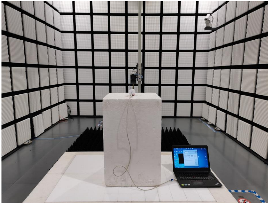
Fig. 3 Radiated emission setup photo(Above 1GHz)