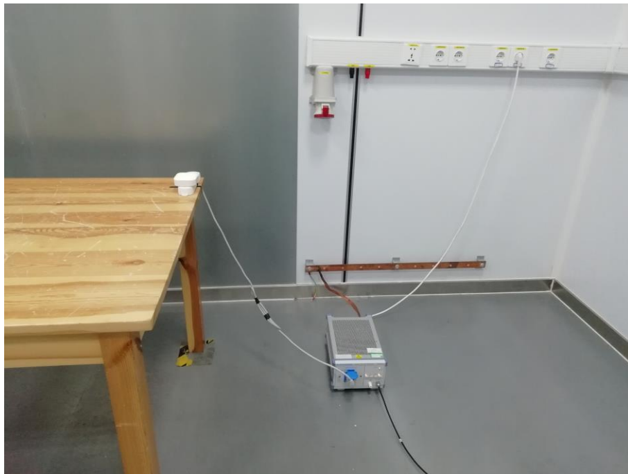
Fig. 4 Power line conducted emission setup photo