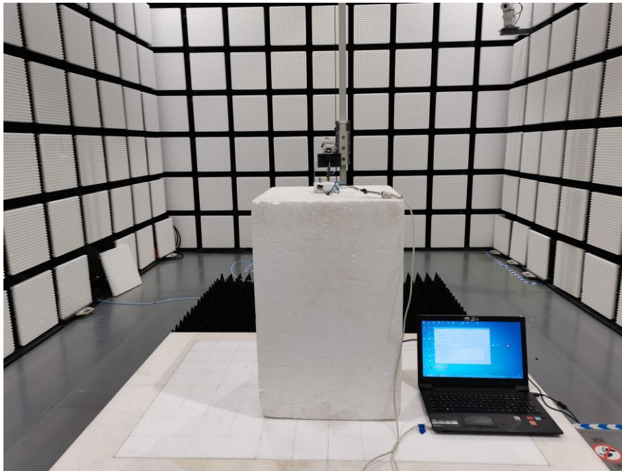
Fig. 3 Radiated emission setup photo(Above 1GHz)