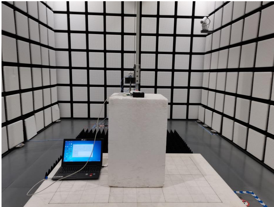
Fig. 3 Radiated emission setup photo(Above 1GHz)