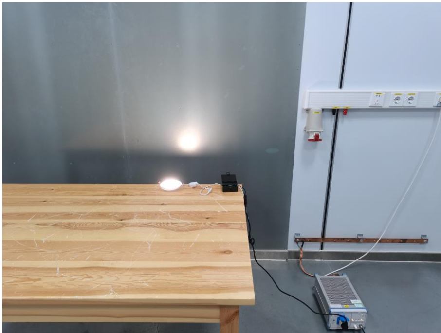
Fig. 4 Power line conducted emission setup photo