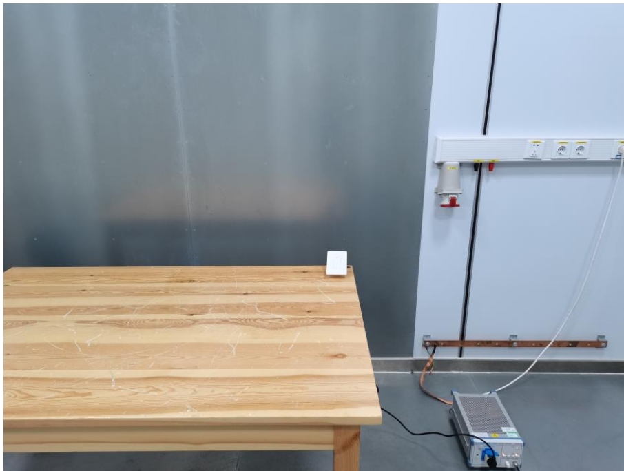
Fig. 4 Power line conducted emission setup photo