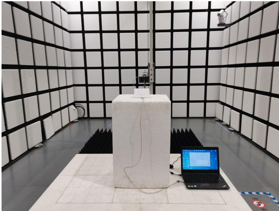
Fig. 3 Radiated emission setup photo(Above 1GHz)