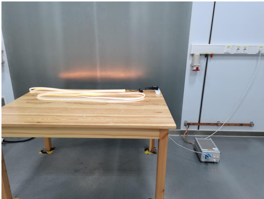
Fig. 4 Power line conducted emission setup photo