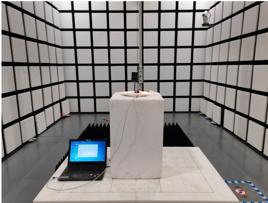
Fig. 3 Radiated emission setup photo(Above 1GHz)