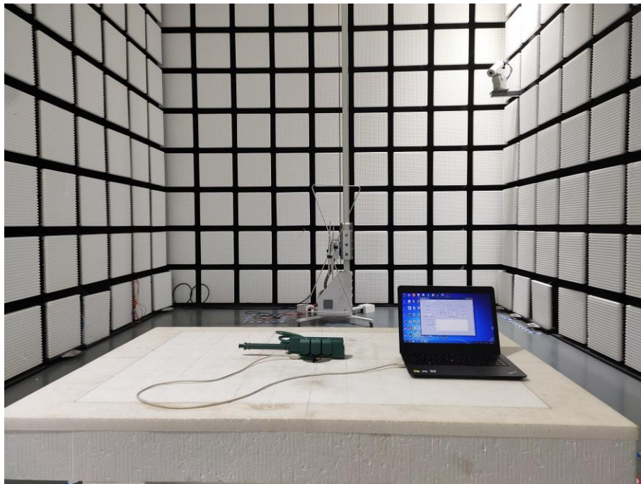
Fig. 2 Radiated emission setup photo(30MHz-1GHz)