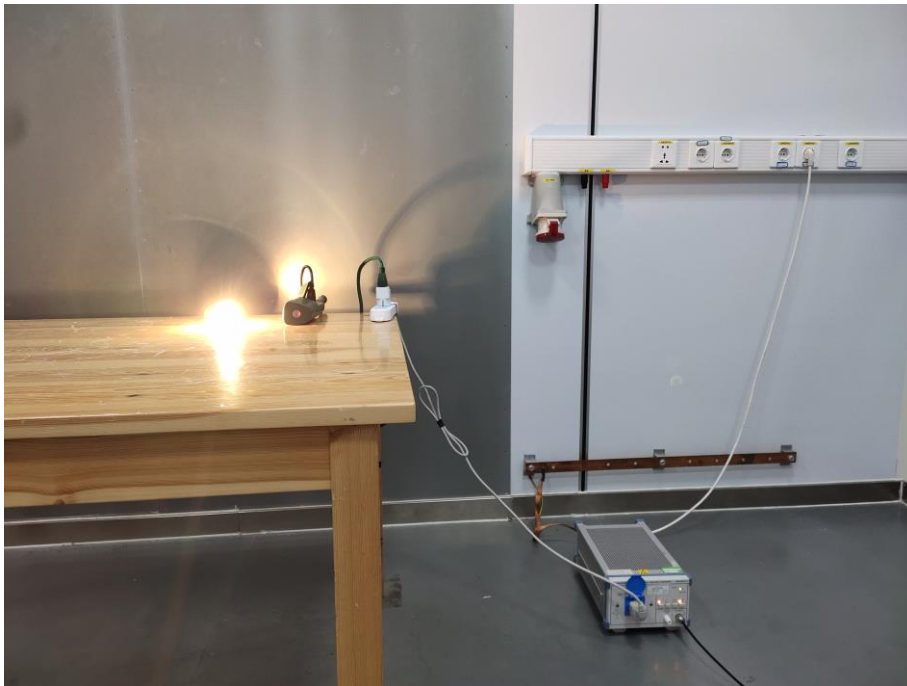
Fig. 4 Power line conducted emission setup photo