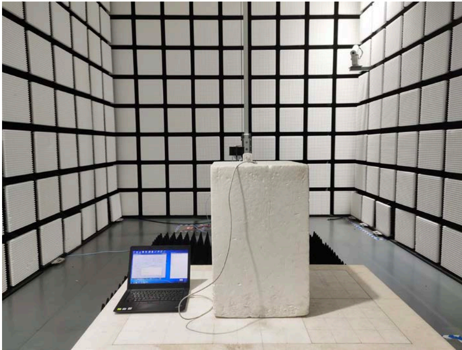
Fig. 3 Radiated emission setup photo(Above 1GHz)