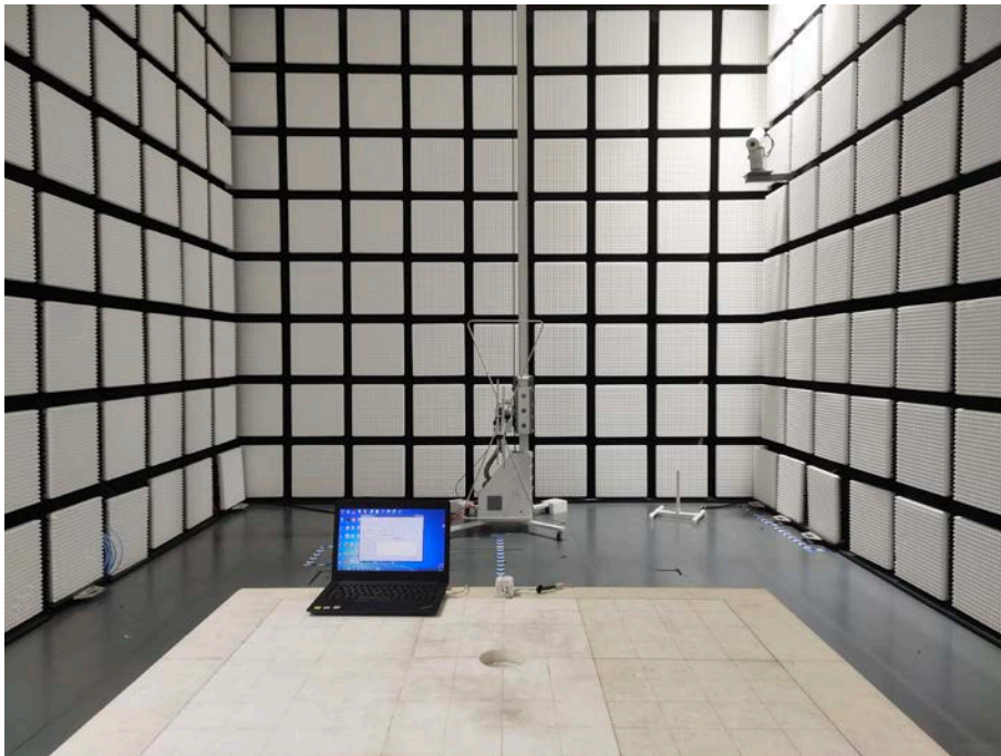
Fig. 2 Radiated emission setup photo(30MHz-1GHz)