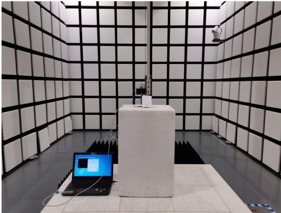
Fig. 3 Radiated emission setup photo(Above 1GHz)