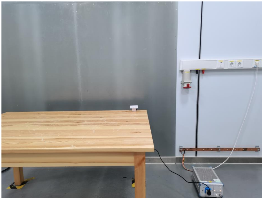
Fig. 4 Power line conducted emission setup photo