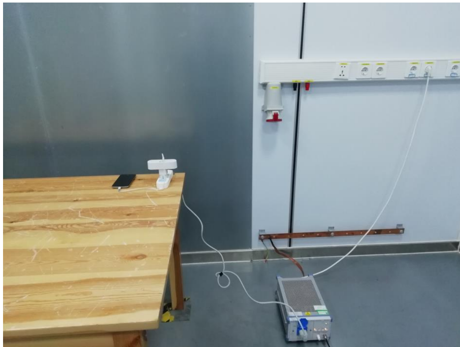
Fig. 4 Power line conducted emission setup photo