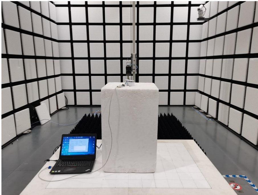
Fig. 3 Radiated emission setup photo(Above 1GHz)