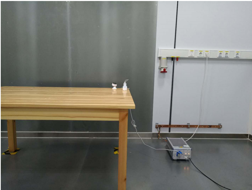
Power line Conducted emission test setup