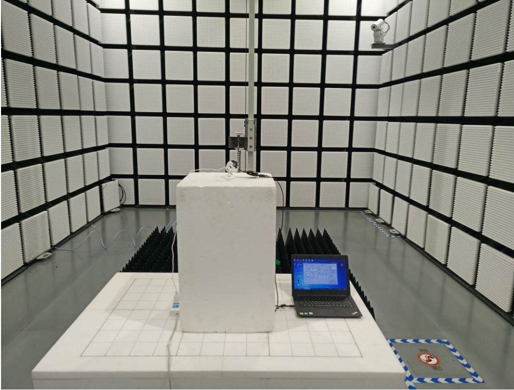
Radiated test setup above 1GHz