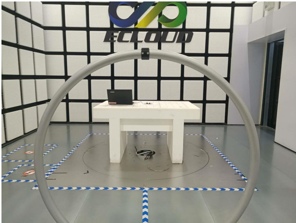
Radiated spurious emission(below 30MHz)