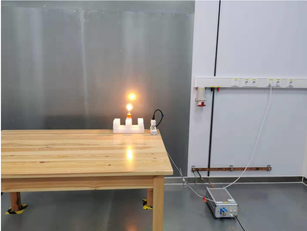
Power line conducted emission