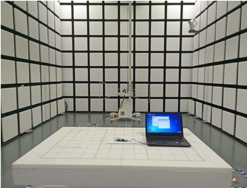
Radiated spurious emission(30MHz~1GHz)