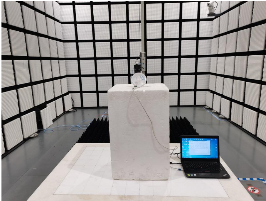
Fig. 3 Radiated emission setup photo(Above 1GHz)