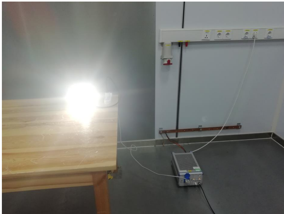
Fig. 4 Power line conducted emission setup photo