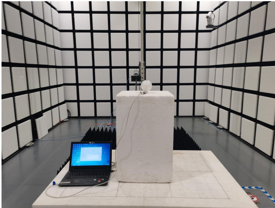
Fig. 3 Radiated emission setup photo(Above 1GHz)