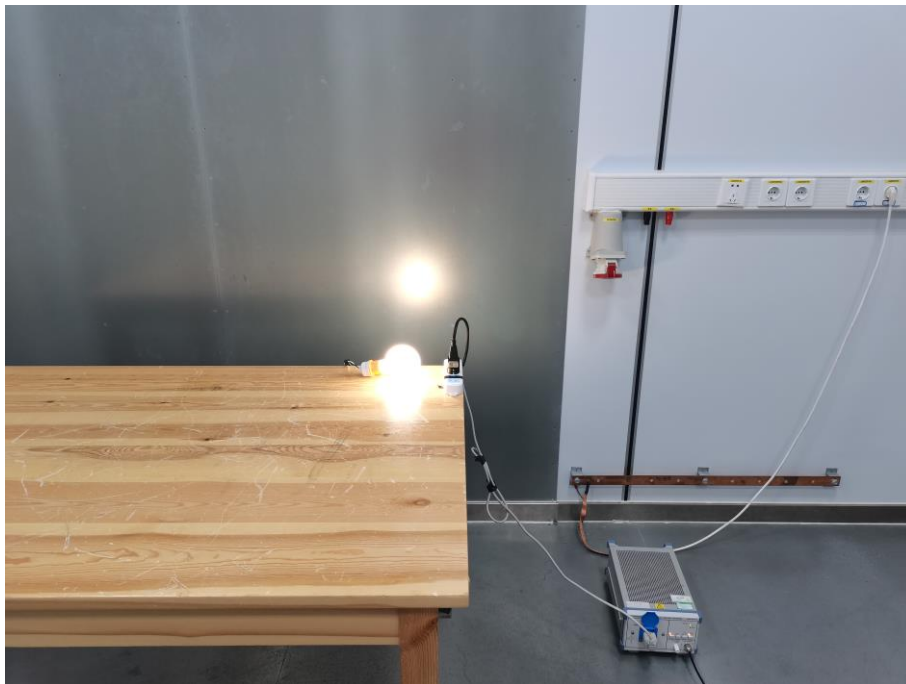
Fig. 4 Power line conducted emission setup photo