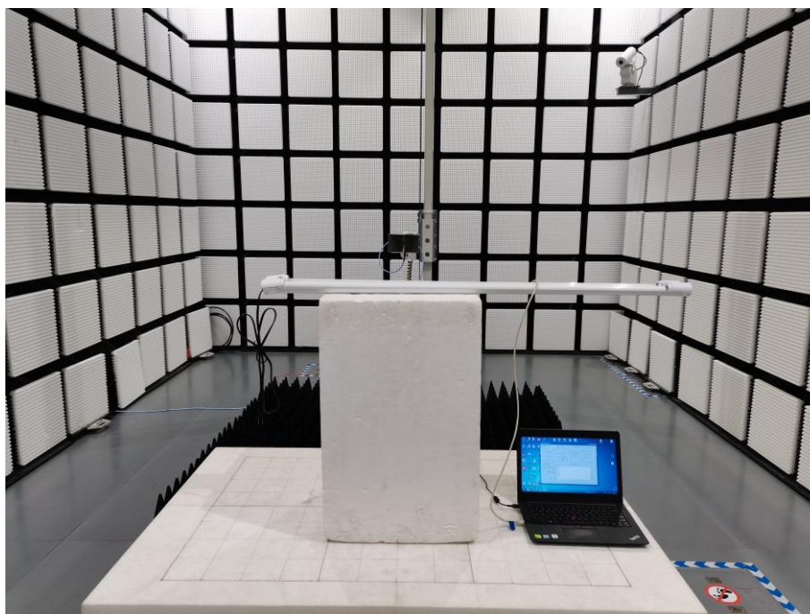
Fig. 3 Radiated emission setup photo(Above 1GHz)