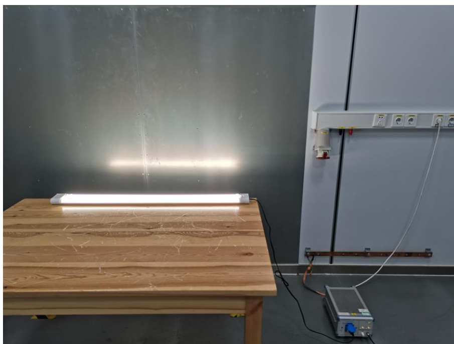
Fig. 4 Power line conducted emission setup photo