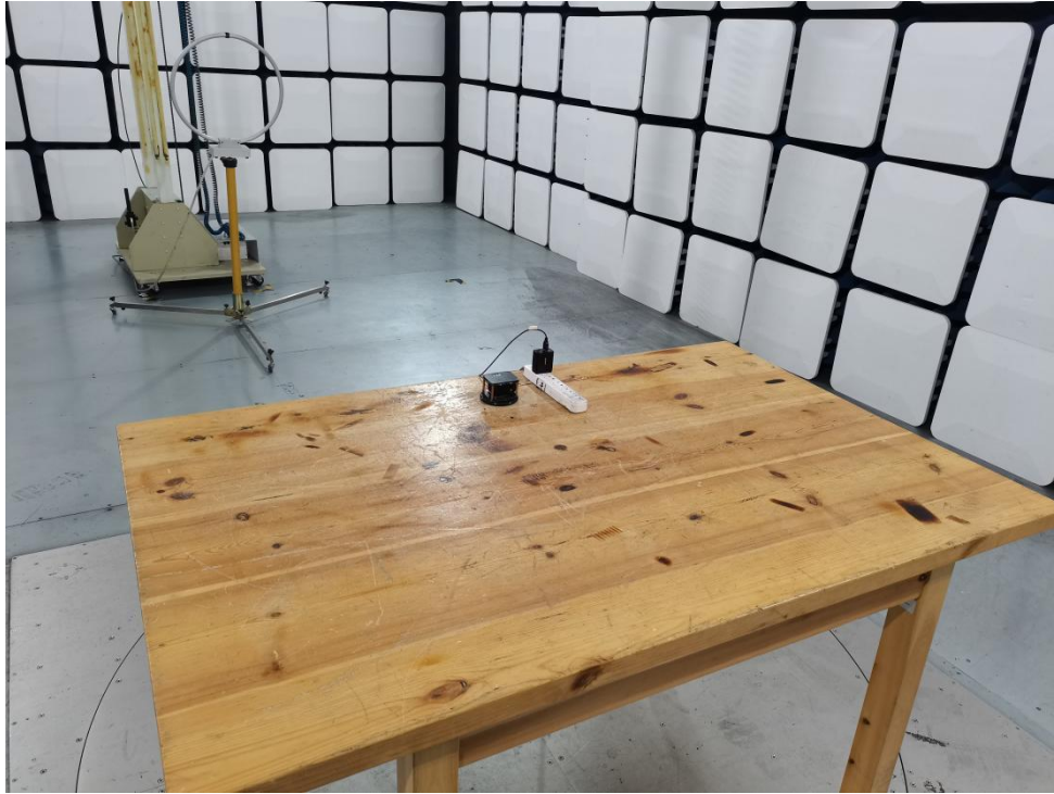
Photo of MPE Measurement