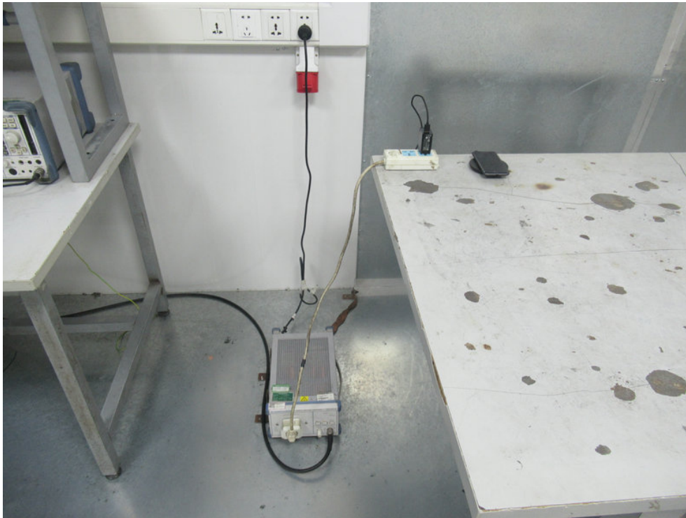
Photo of Radiation Emission Test