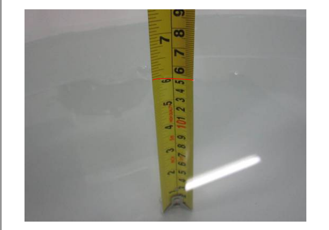
Liquid depth \geq 15cm