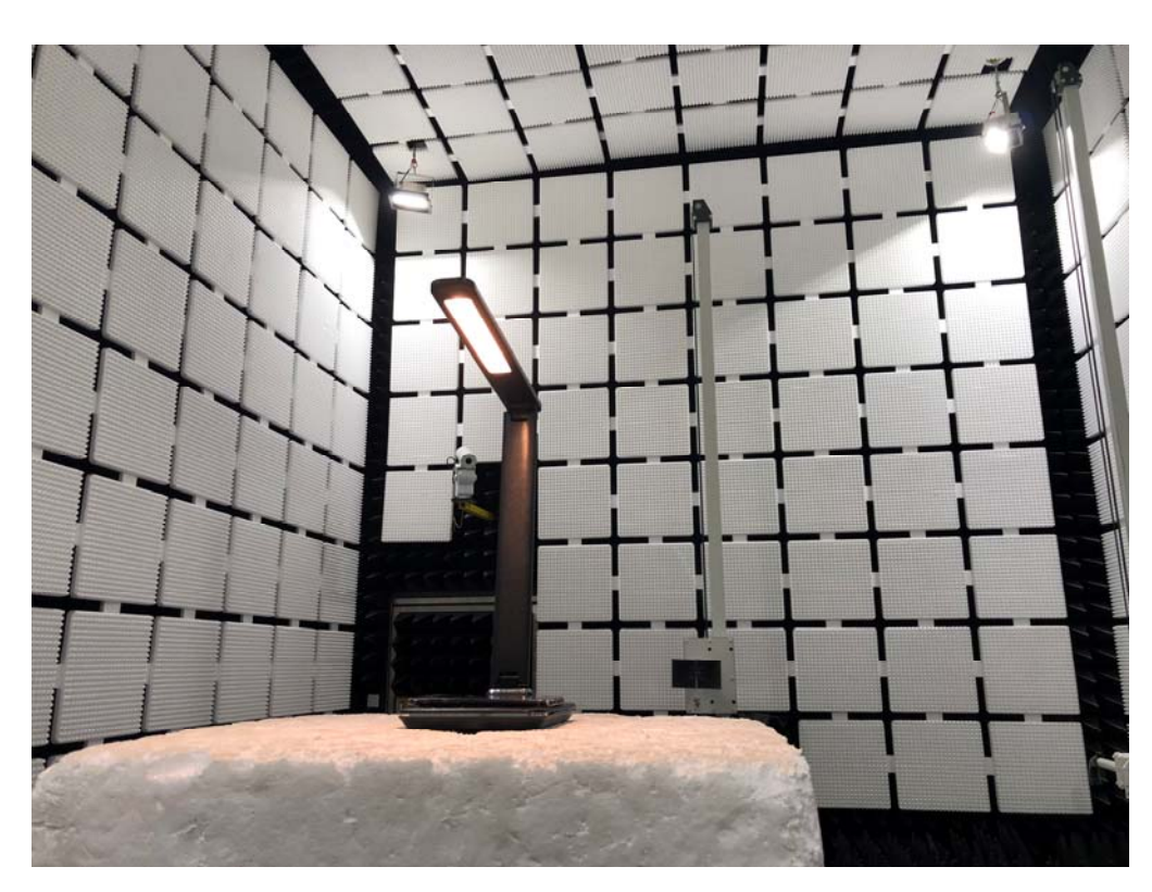
Radiated Emission Above 1 GHz

This report shall not be reproduced except in full, without the written approval of Shenzhen LCS Compliance Testing Laboratory Ltd. Page 3 of 3