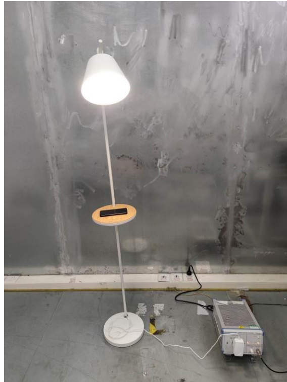
Conducted Emission-AC adapter charge mode