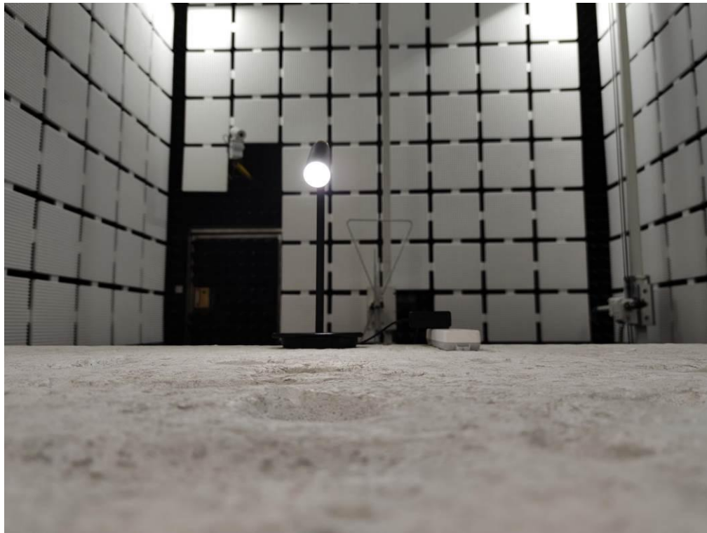
Radiated Emission Below 1 GHz