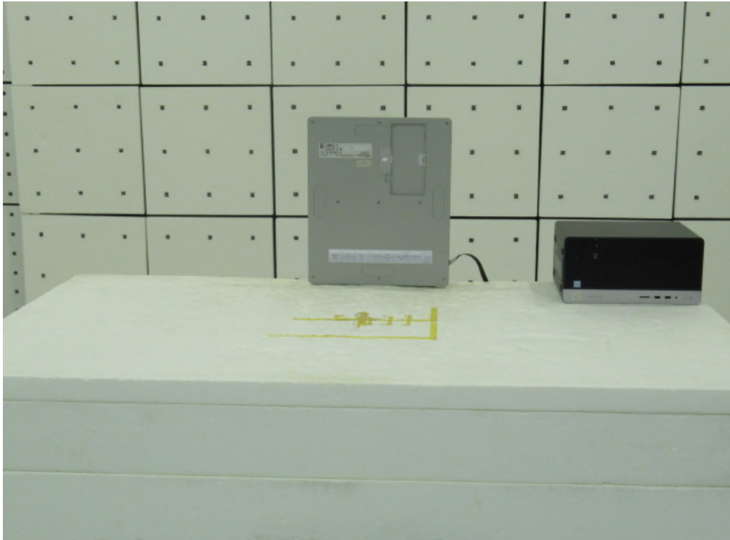
Radiated Emission Set up Photos (Above 1GHz)