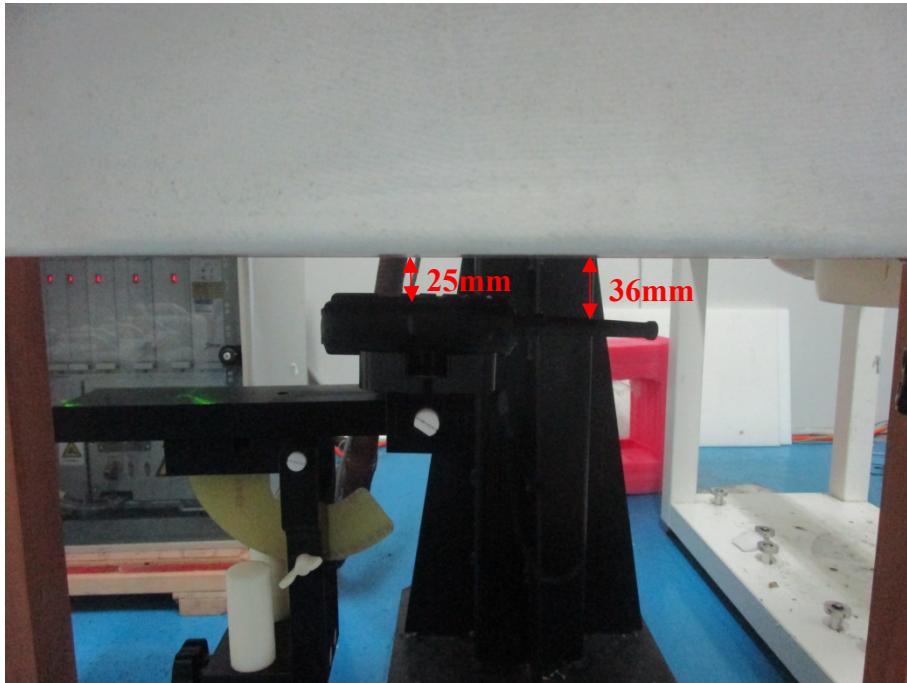
Body Back Setup Photo (0mm)