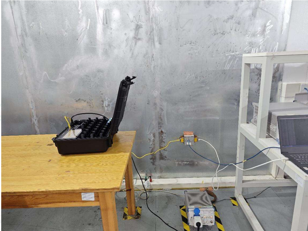
Photo of Power Line Conducted Measurement