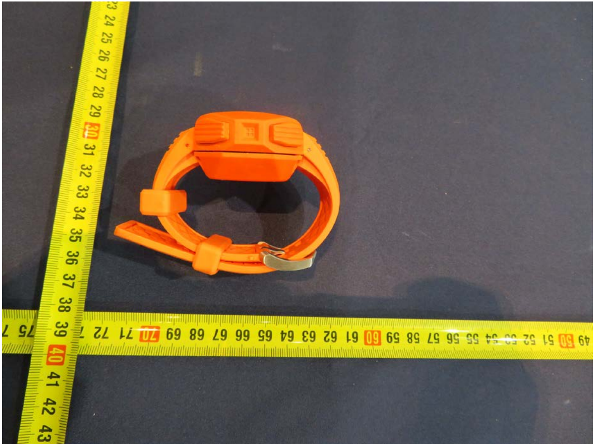
Page 2 of 3