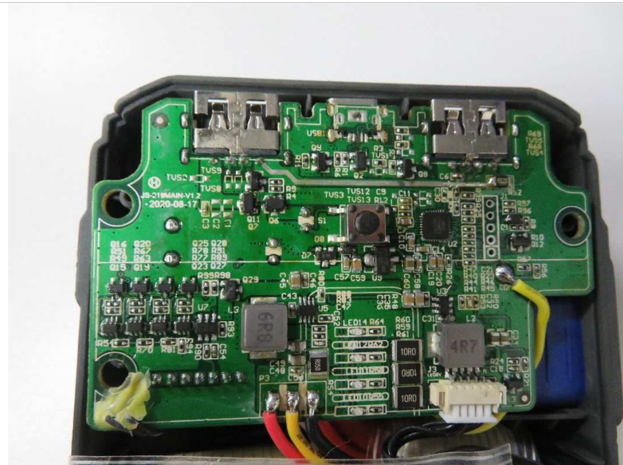
PCB and coil view