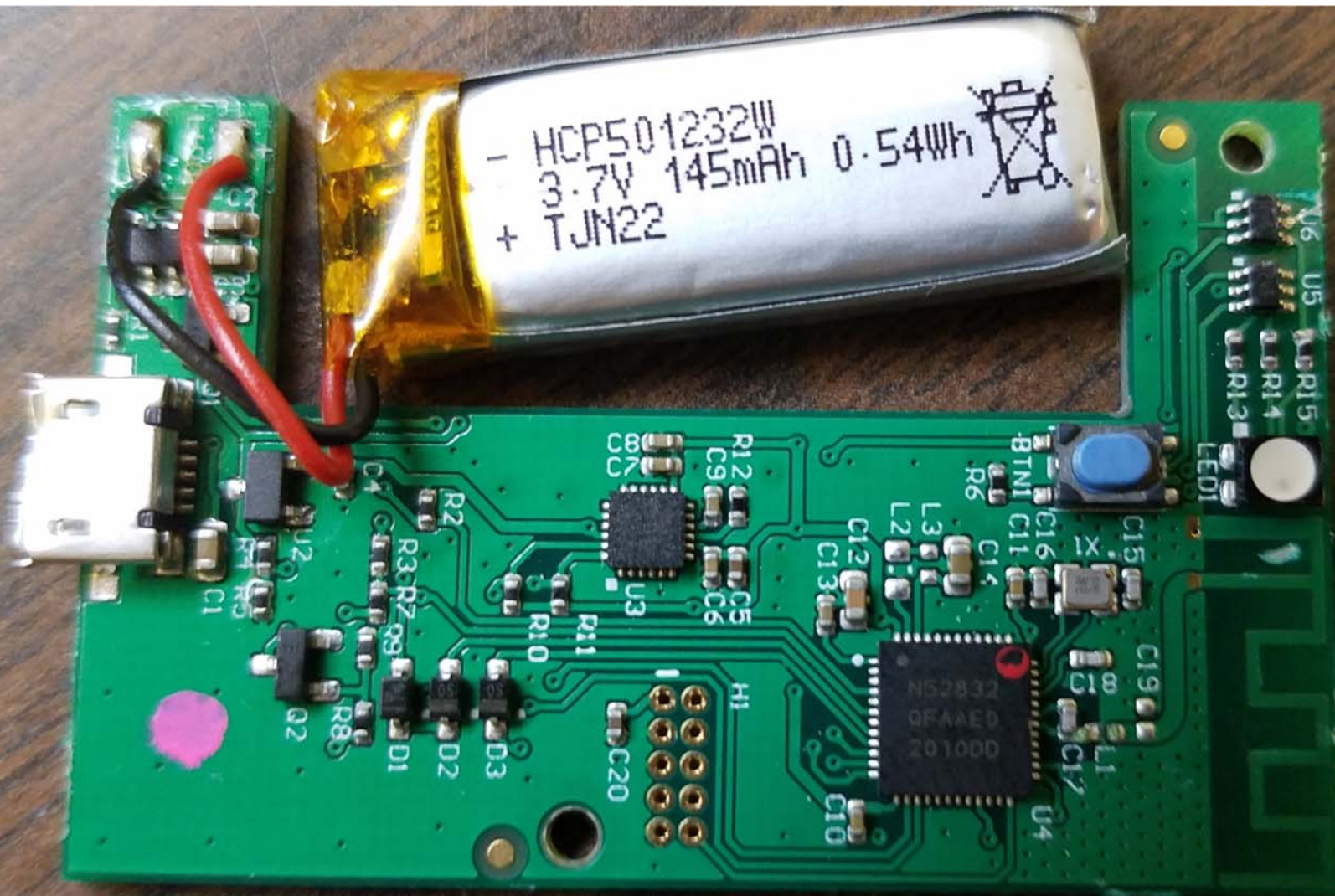
Top View of the PCB - #3