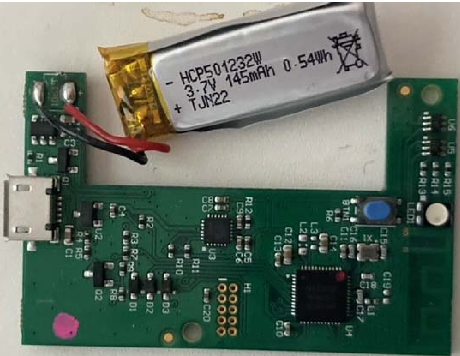
Top View of the PCB