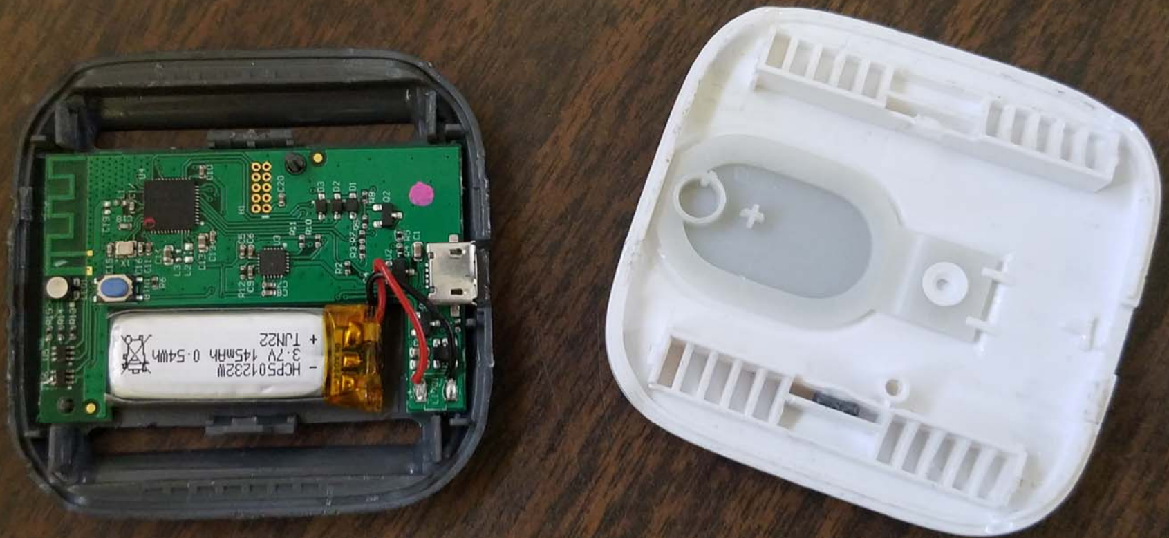
Inside View of the EUT