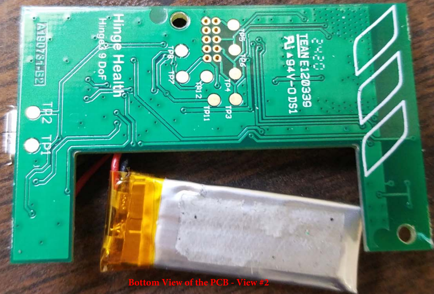
Bottom View of the PCB - View #2