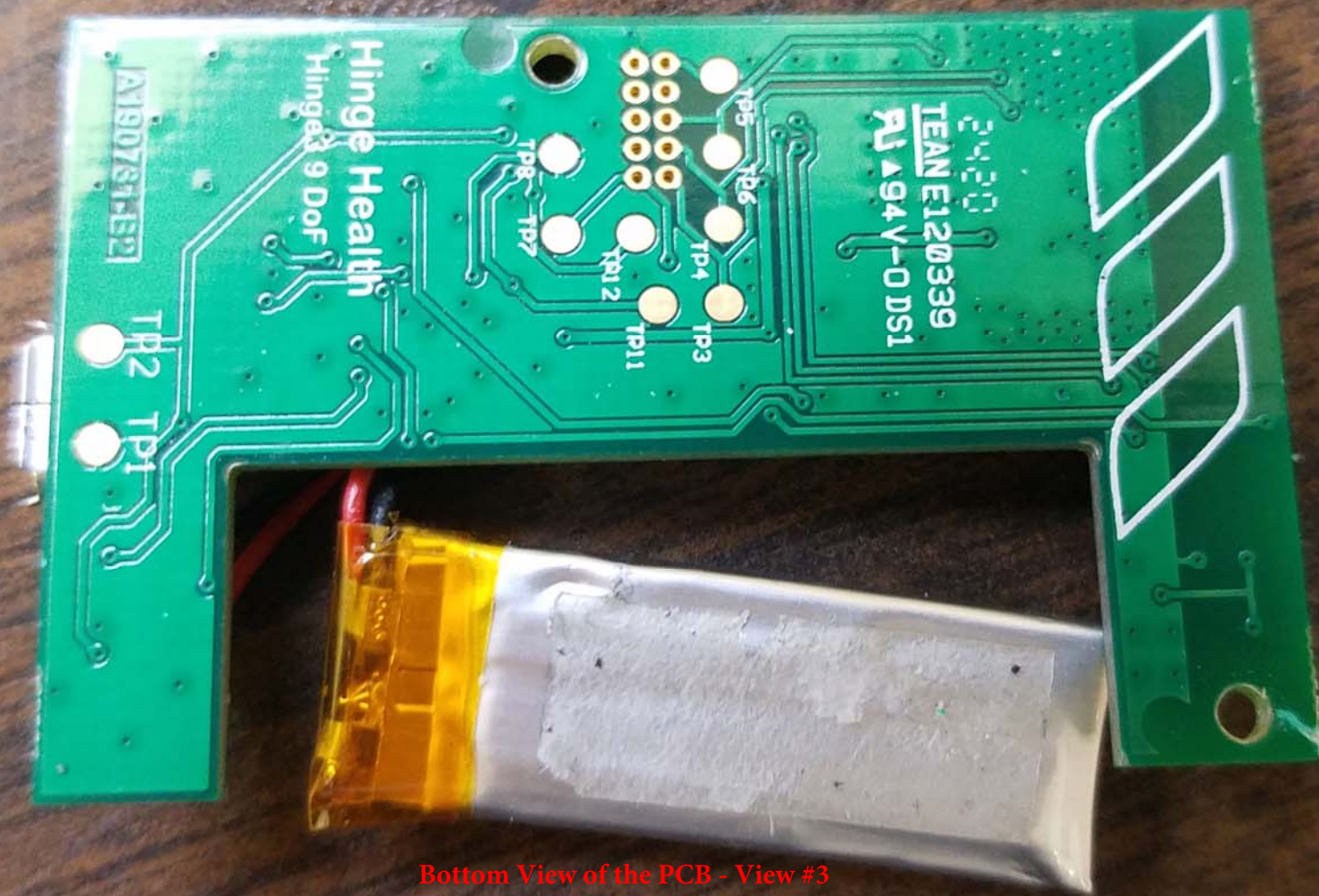
Bottom View of the PCB - View #3