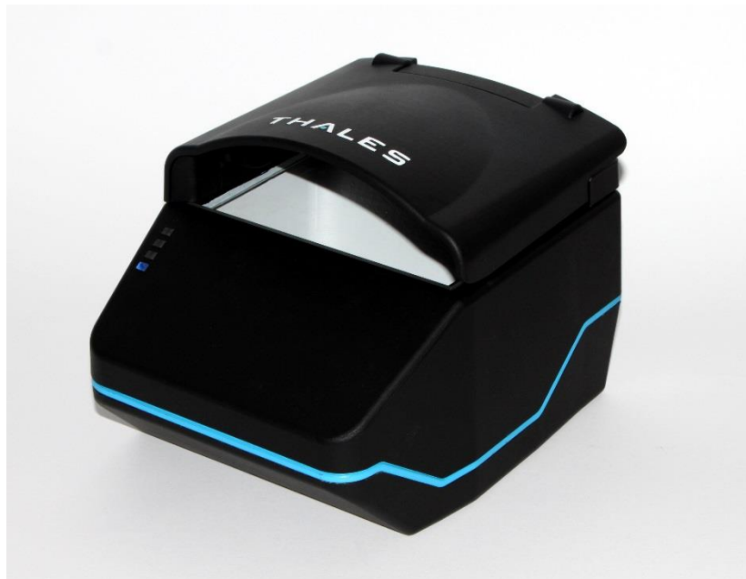
Gemalto Document Reader QS2000

Various add-on options are available for the Gemalto QS2000 including a contact smart-card module and a Chinese NID card RFID reader.