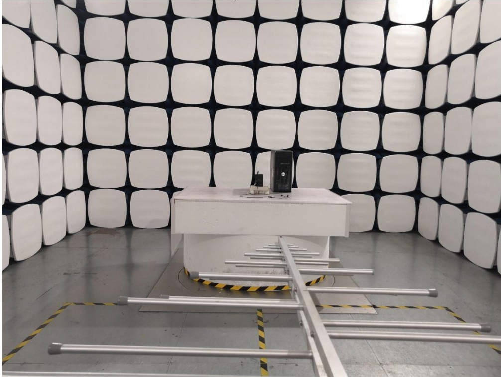
Radiated Spurious Emission